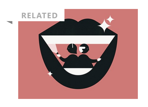
<u>Part of Nature Outlook: Oral</u> health

microbes survive in the oral environment, but the average person has around 250 species <sup>1</sup> from a pool of around 700 documented oral residents <sup>2</sup>. These species can evade the anti-microbial defences of saliva and are also adapted to living in a warm, wet environment that is regularly bathed in oxygen.